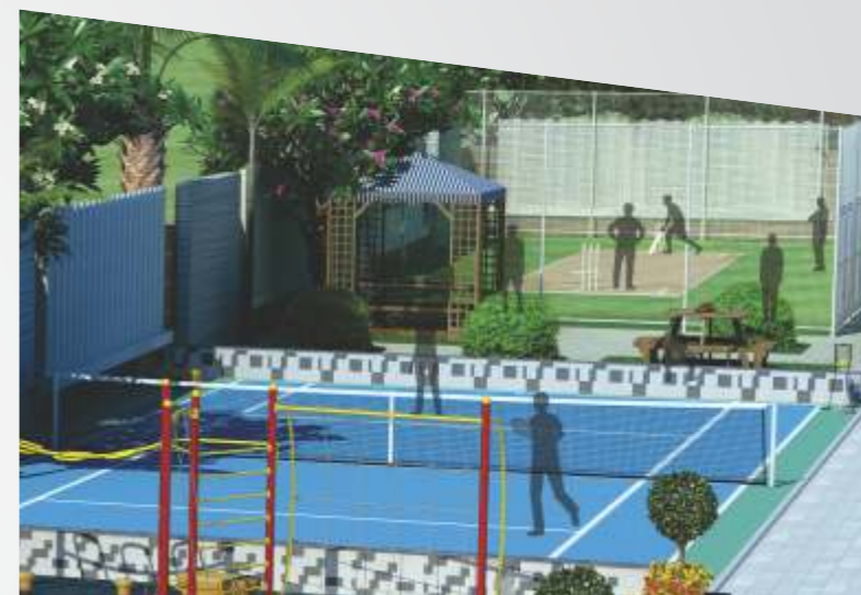
Lawn Tennis & Cricket