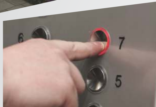
Branded High Speed Elevators