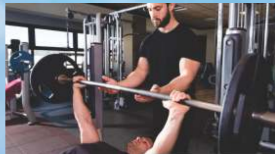
The Gymnasium: Make fitness a way of life