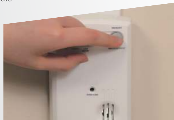
Gas Leak Detector