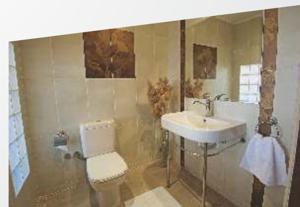
Designer Dado tiles