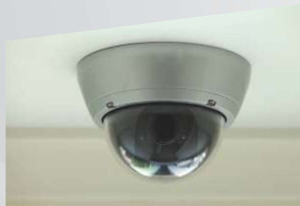
Surveillance Security Cameras