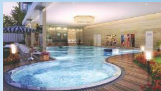
The Swimming Pool: Sink into the lap of luxury