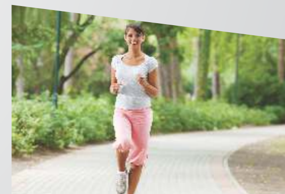
Paved Jogger's track