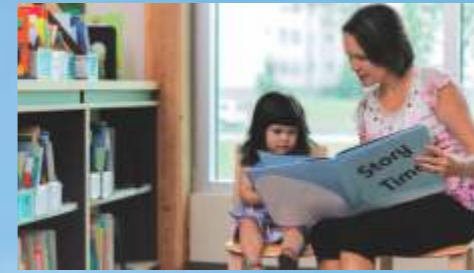
The Reading Area: Add a new chapter to your life, everyday.