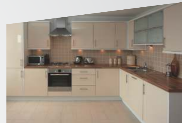
Granite Kitchen platform & Stainless Steel sink