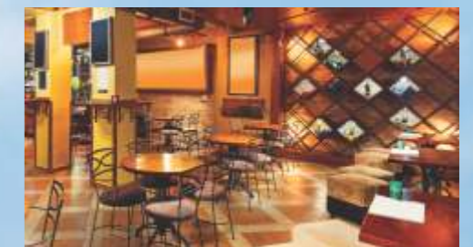
The Cafeteria: A Social Experience