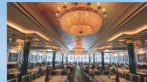
The Banquet Hall: Entertain your guests in style