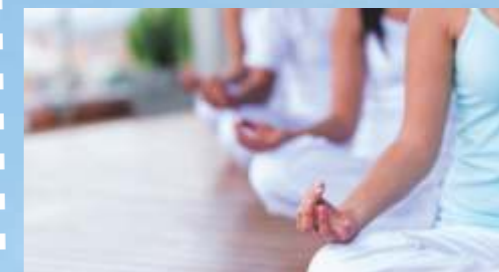
The Wellness Center: Pamper your senses