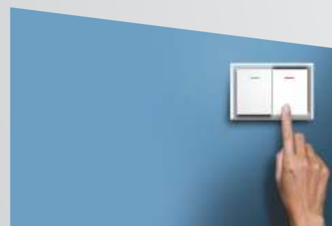
Branded modular switches